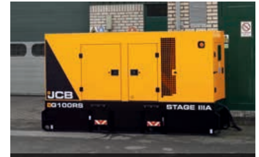
Highly versatile, powered by a wide range of engine manufacturers to suit every application.