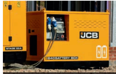
The JCB Hybrid range provides alternative power sources.