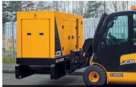
A range of lifting options for ultimate manoeuvrability and product positioning on site.