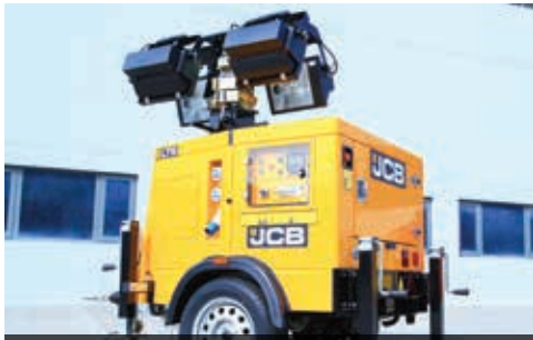
A range of high performance light solutions provide efficient light anywhere.